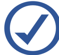
CIPD Best Practice